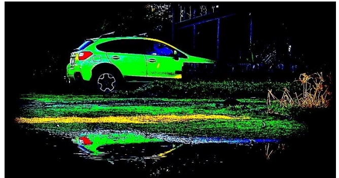
Green car: Jon Hogan Highly commended