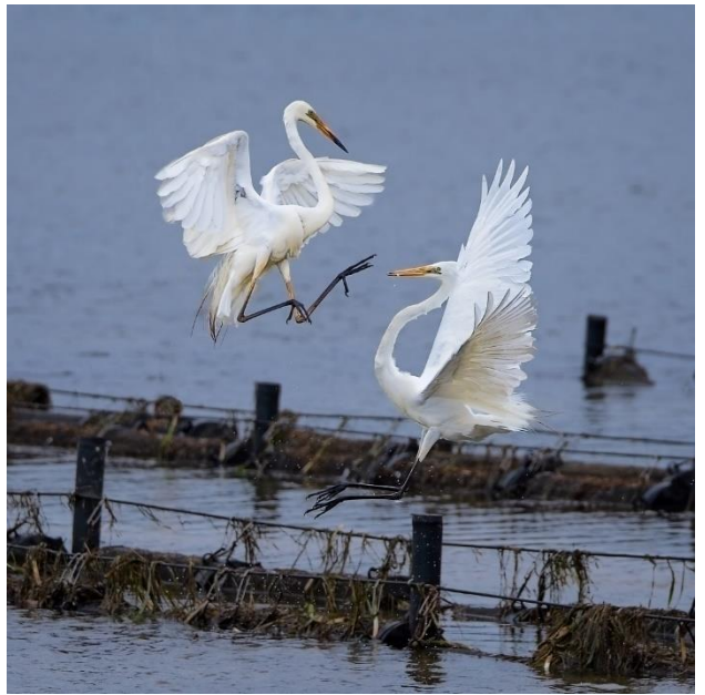
Egret Barney: Graeme Lawry Highly commended