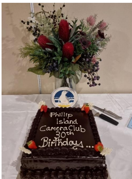
30 th Anniversary cake at the RSL celebration dinner on 22 nd May.