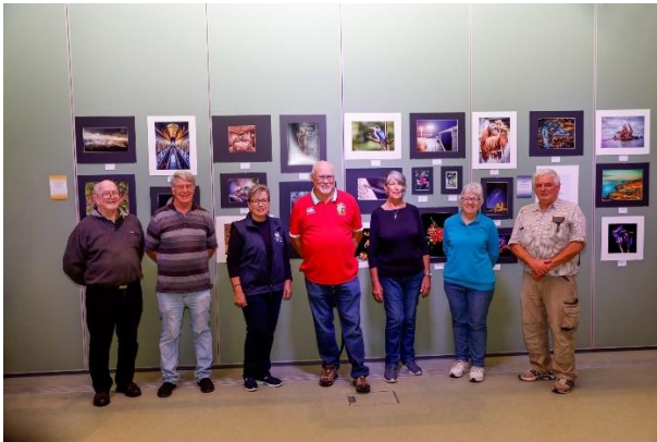
Thanks to those who set up (and took down) the photographic exhibition at Berninnet, Cowes.