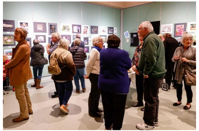
Guests enjoy the exhibition opening on 17 th May.