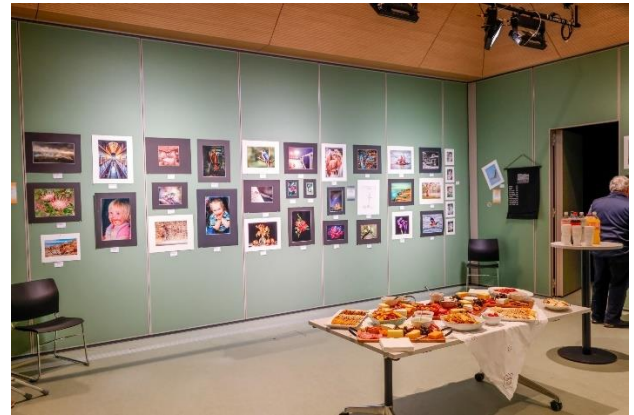
Ready for the opening of the exhibition.