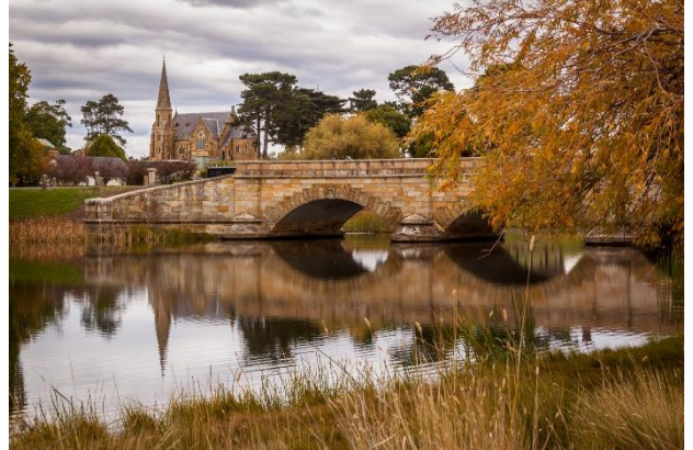
Ross Bridge Tasmania: Rhonda Buitenhuis Highly commended