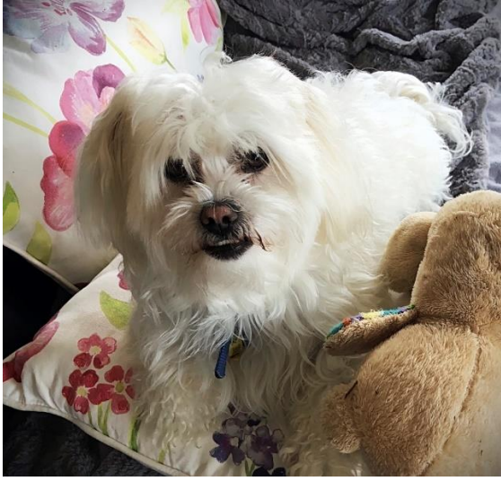
Commended: Louie Lacey 3 Alan Lacey