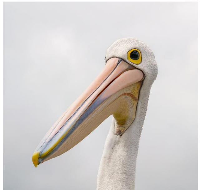
Highly commended: PRINT – Australian Pelican Will Hurst