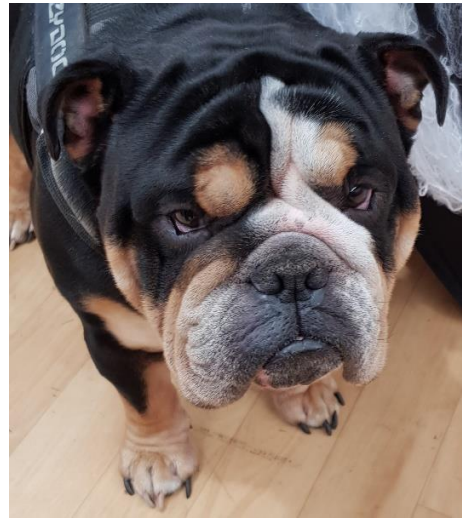
Highly commended: You got a problem? Lorraine Tran