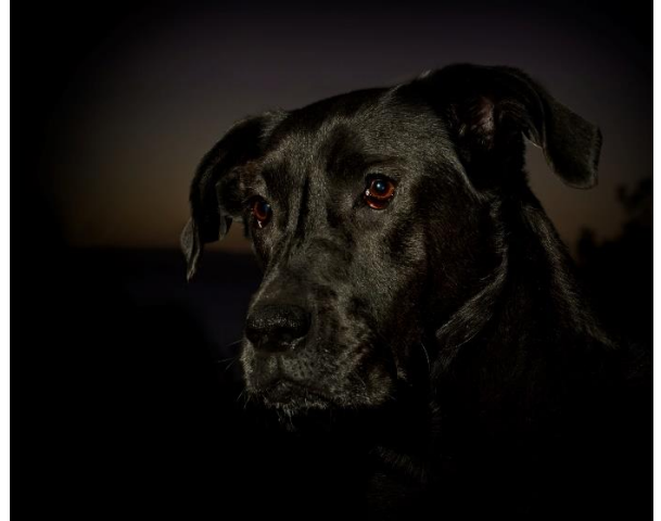
Highly commended: Missy 2 Ian Prain