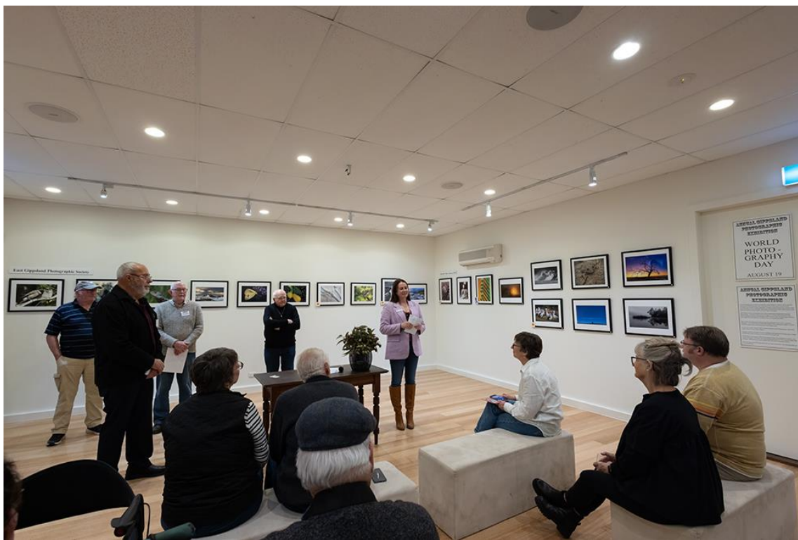
Opening of the Gippsland Interclub Photographic Exhibition at Coal Creek.