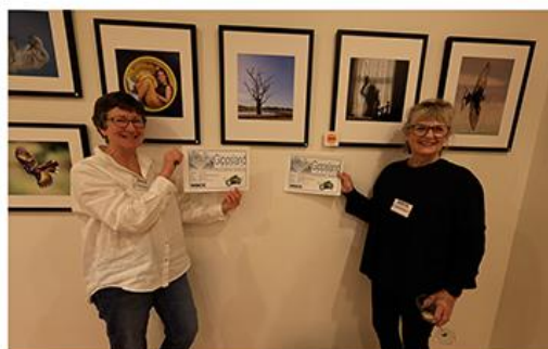
Opening of the Gippsland Interclub Exhibition.