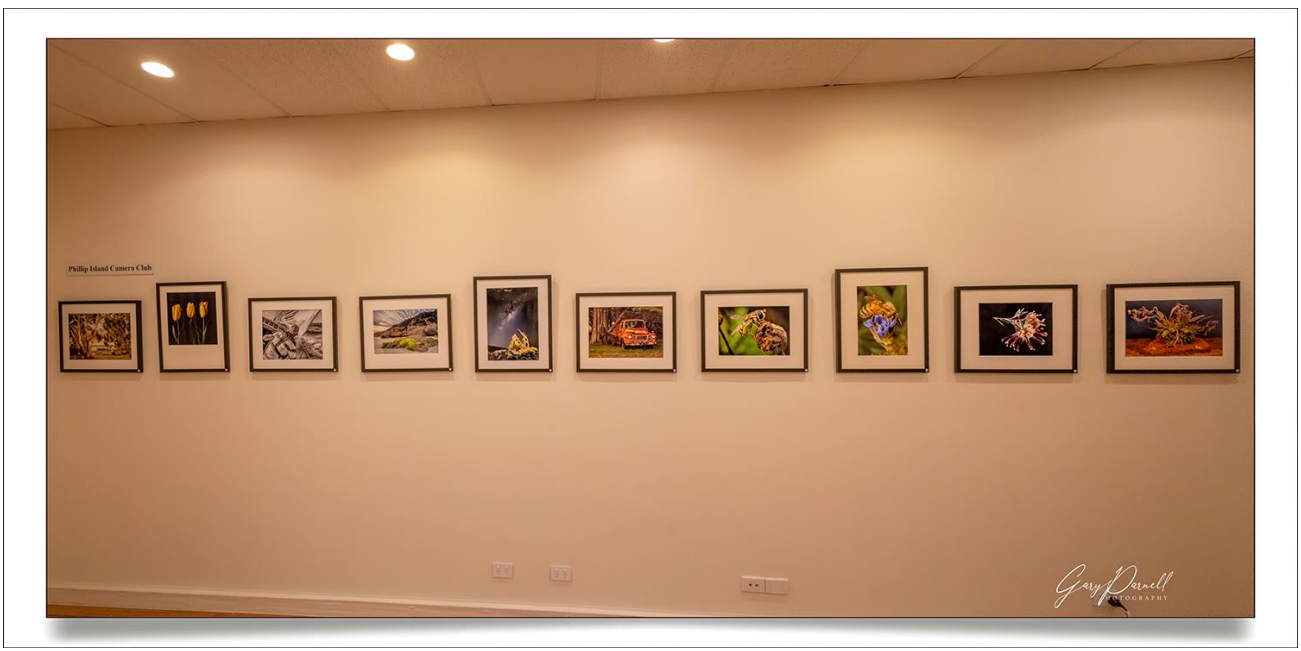
Above: Phillip Island Camera Club display of images at the Gippsland Interclub exhibition and below a view of the exhibition.