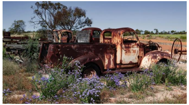
Commended: 3 Old Beauties Brenda Berry