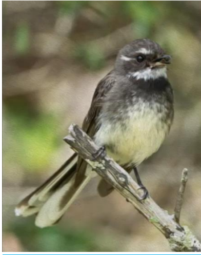
Commended: PRINT- Grey fantail Will Hurst