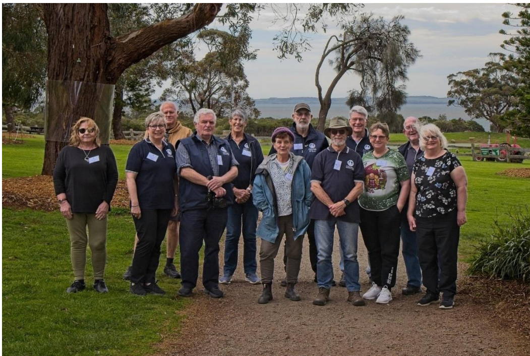
Participants in the Photography Walking for Wellness at Churchill Island.

The camera club plans to continue holding Photography Walk for Wellness events in the future and hopes the events will be well supported.