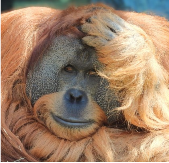
Orangutan