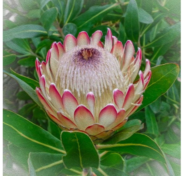
Flowers with Filters – Will Hurst