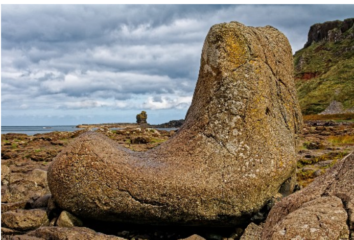
A natural Structure from an unusual angle