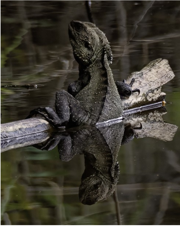
'Gippsland Water Dragon'