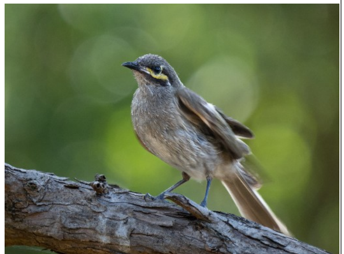
'Yellow Faced Honeyeater' – Jenny Skewes