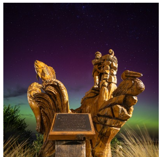
A natural structure enhanced by man, with another point of interest