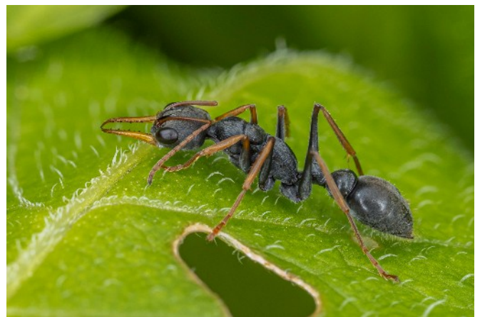
'Ant' – Will Hurst