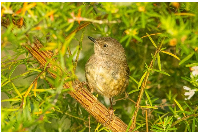
'Brown Thornbill'